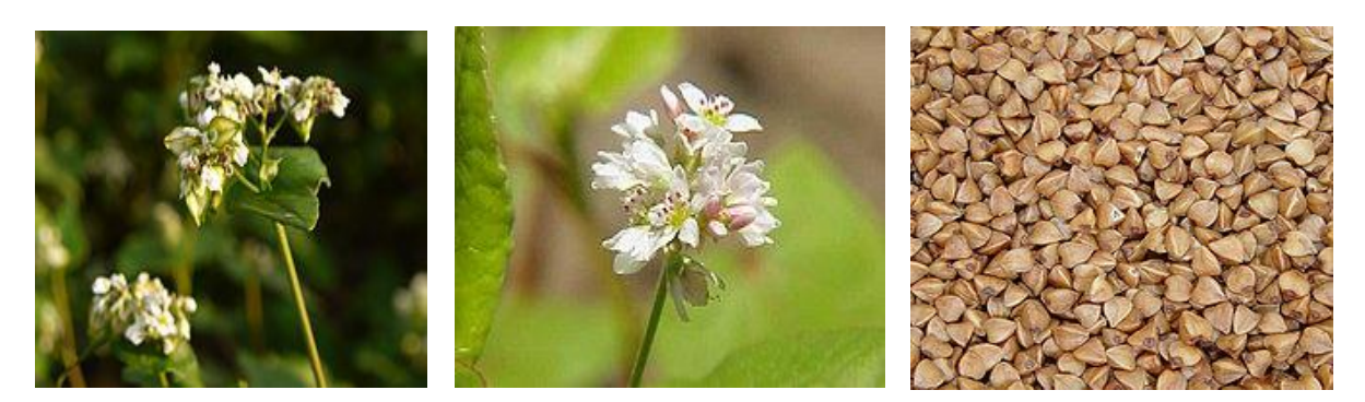
F. Esculentum Common buck wheat flower Seeds Fig. 2: Pictorial representation of common buck wheat plant and seeds

surround the pistil and open outwards, while the other five are closer to the outside and open inward. Nectar-secreting glands are at the base of the ovary. New flower forms such as the one found by<sup>6</sup>, have short stamens and pistils and are well adapted to selfpollination<sup>8,9</sup>. and reported the inheritance of the flower type in common buckwheat as monogenic. A ratio of 1:1 of the flower types occurs owing to the incompatibility system. Although genetic control of the flower type, either pin or thrum, appears monogenic, the locus probably is a complex one resembling the model proposed by<sup>10,6,6</sup>.found eight distinct classes of style length in F<sub>2</sub> populations derived from crosses between inbred lines of pin flowers with differing style length. He also developed self-fertile lines that bred true for reduced style length. Two sizes of pollen are associated with the heteromorphic system. Large pollen grains approximately 0.16 mm in diameter are produced by thrum flowers while pin flowers produce smaller pollen grains that are approximately 0.10 mm in diameter.